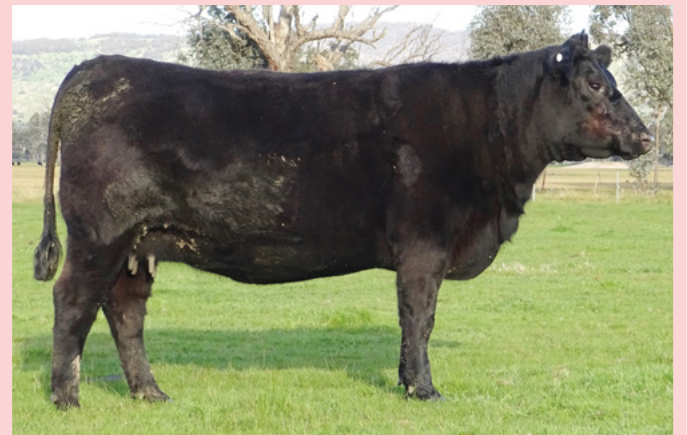
Lot 30 GSBN84