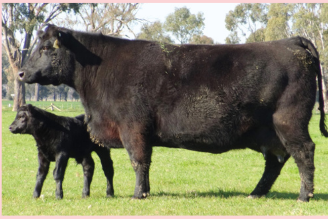
Lot 3 HXIK104