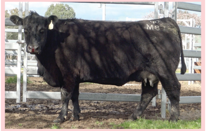
Lot 4 GSBM81