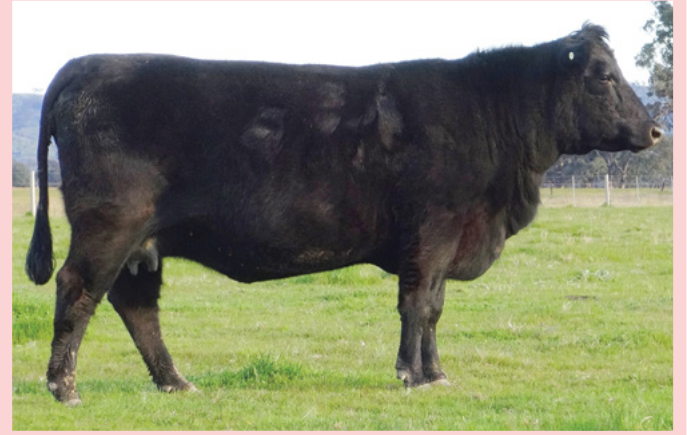
Lot 14 NDLN91