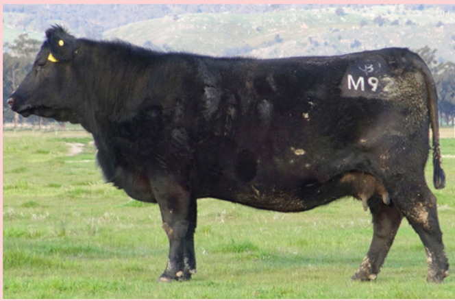
Lot 21 GSBM92