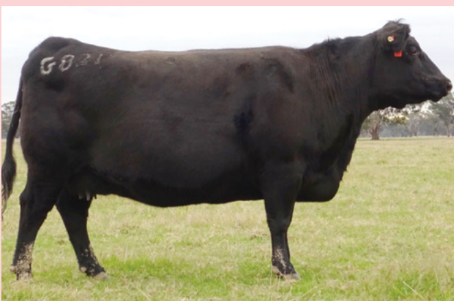
Lot 11 VCCG821