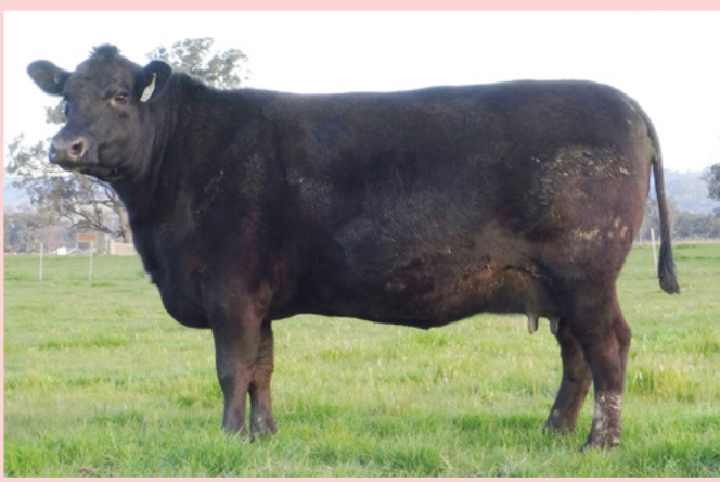
Lot 1 GSBL26