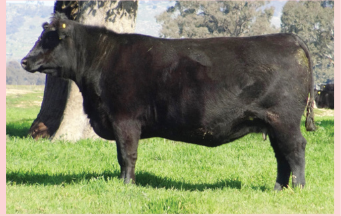
Lot 26 GSBM33