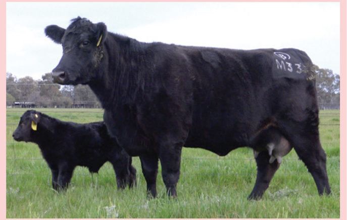
Lot 16 GSBM33