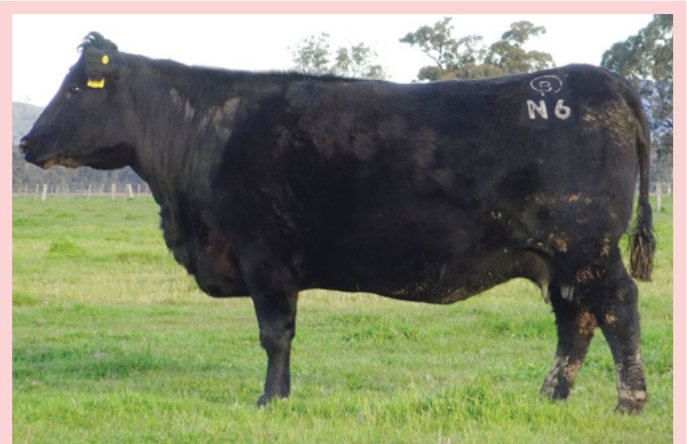
Lot 18 GSBN6