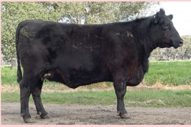
Lot 5 GSBM82