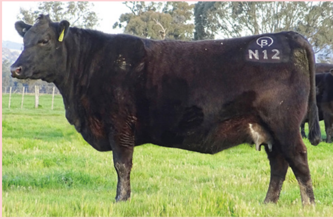
Lot 19 GSBN12