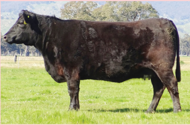
Lot 27 GSBM6