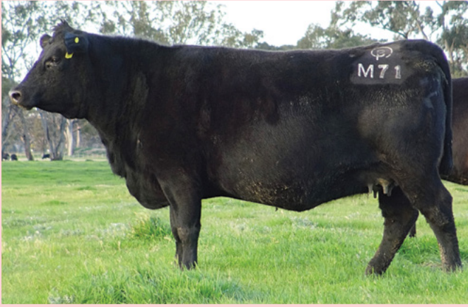
Lot 25 GSBM71