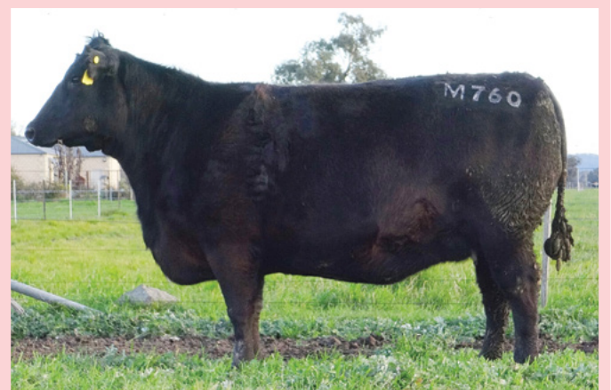
Lot 12 VCCM760