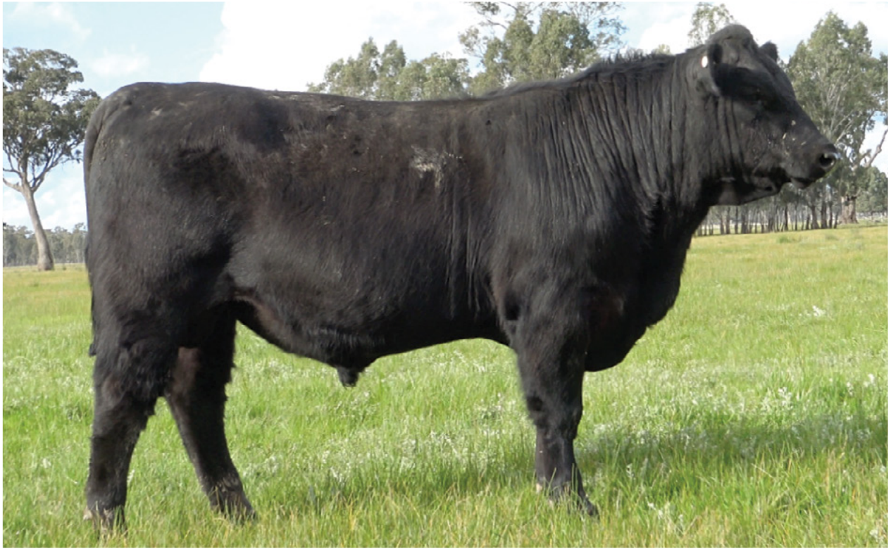
Photo: Q40 at 12 months