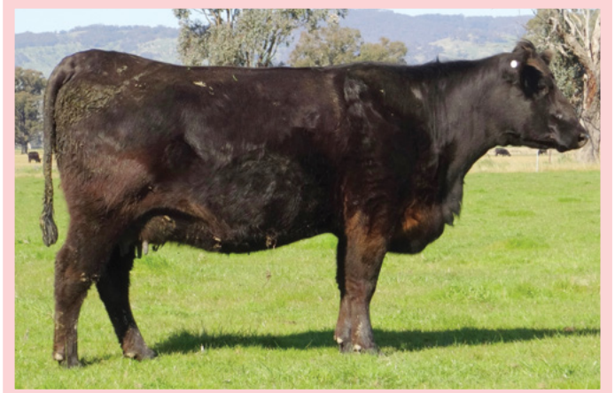
Lot 2 GSBN24