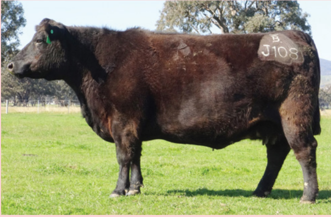
Lot 13 QPDJ108