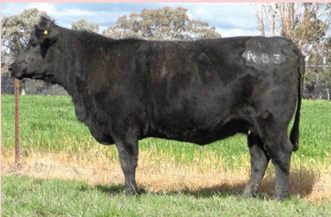
Lot 29 GSBN83