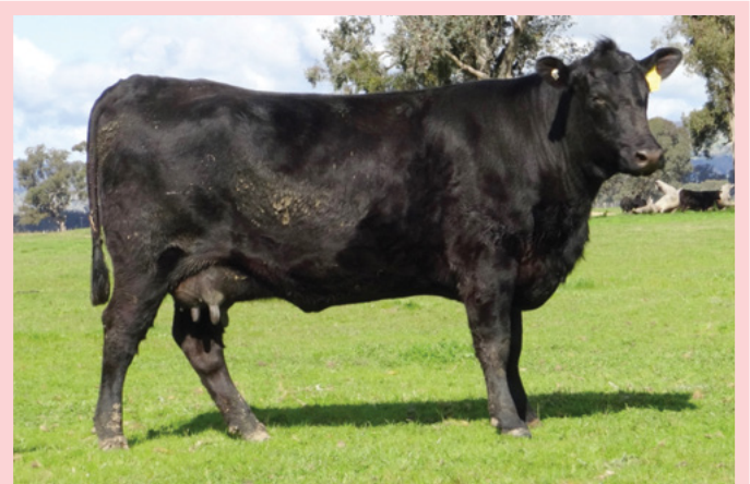
Lot 24 GSBN59