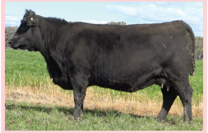
Lot 6 NZCM121