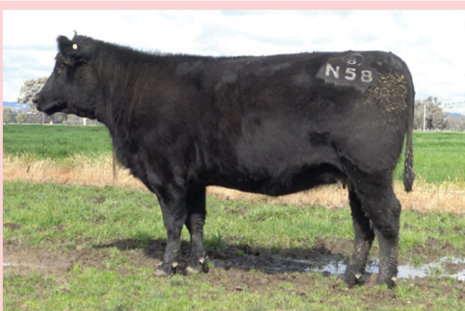
Lot 23 GSBN58