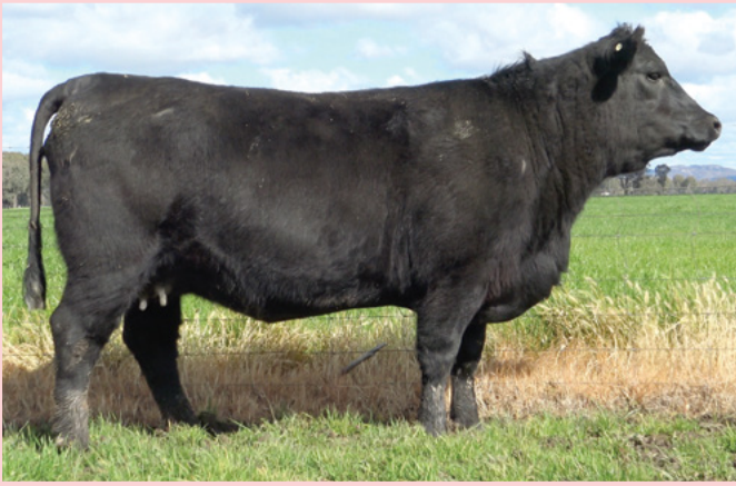
Lot 7 DBLN443