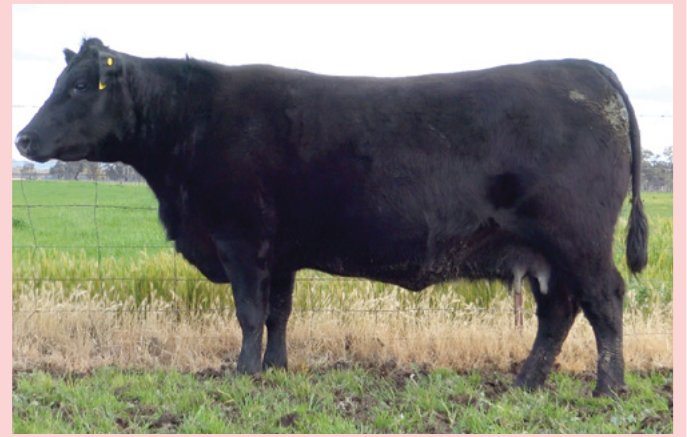
Lot 28 GSBM13