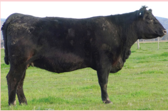
Lot 9 DBLN449