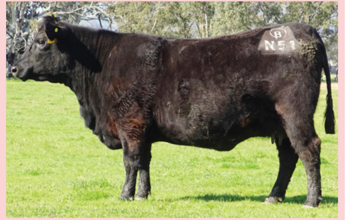
Lot 20 GSBN51