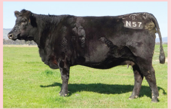
Lot 22 GSBN57