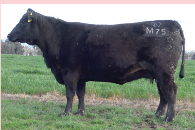
Lot 17 GSBM75