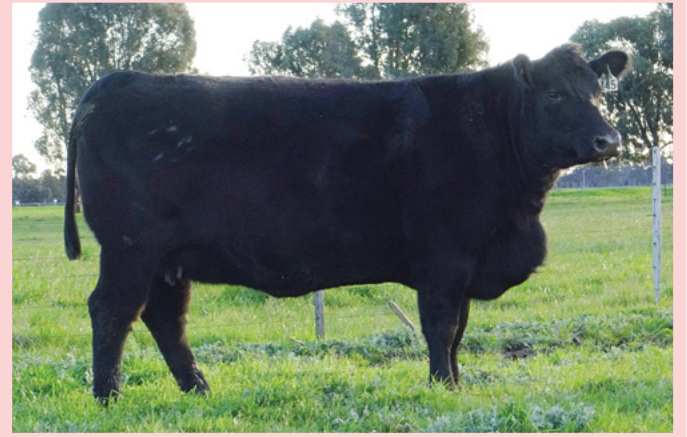
Lot 8 DBLN445