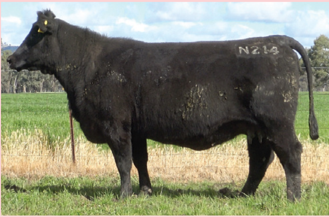
Lot 15 NDLN214