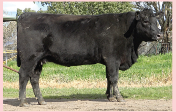
Lot 10 DBLN543